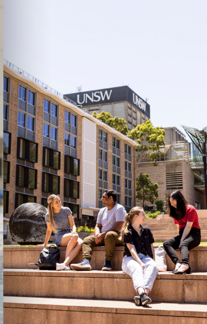
UNSW main walkway