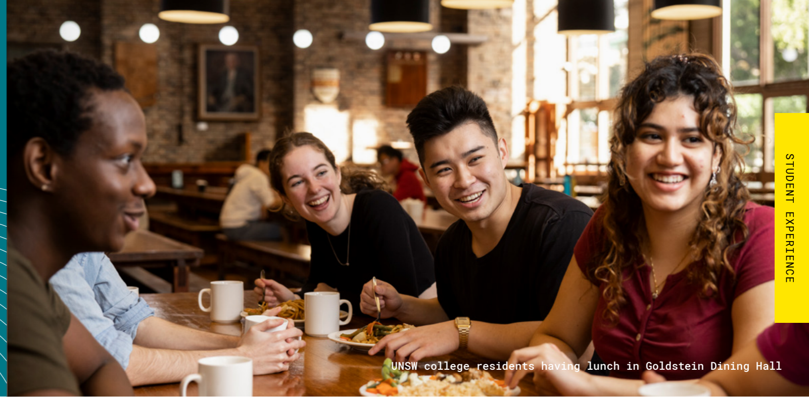
UNSW college residents having lunch in Goldstein Dining Hall

➤ Find the home that is right for you. Take 360 virtual tours of rooms and compare prices at accommodation.unsw.edu.au