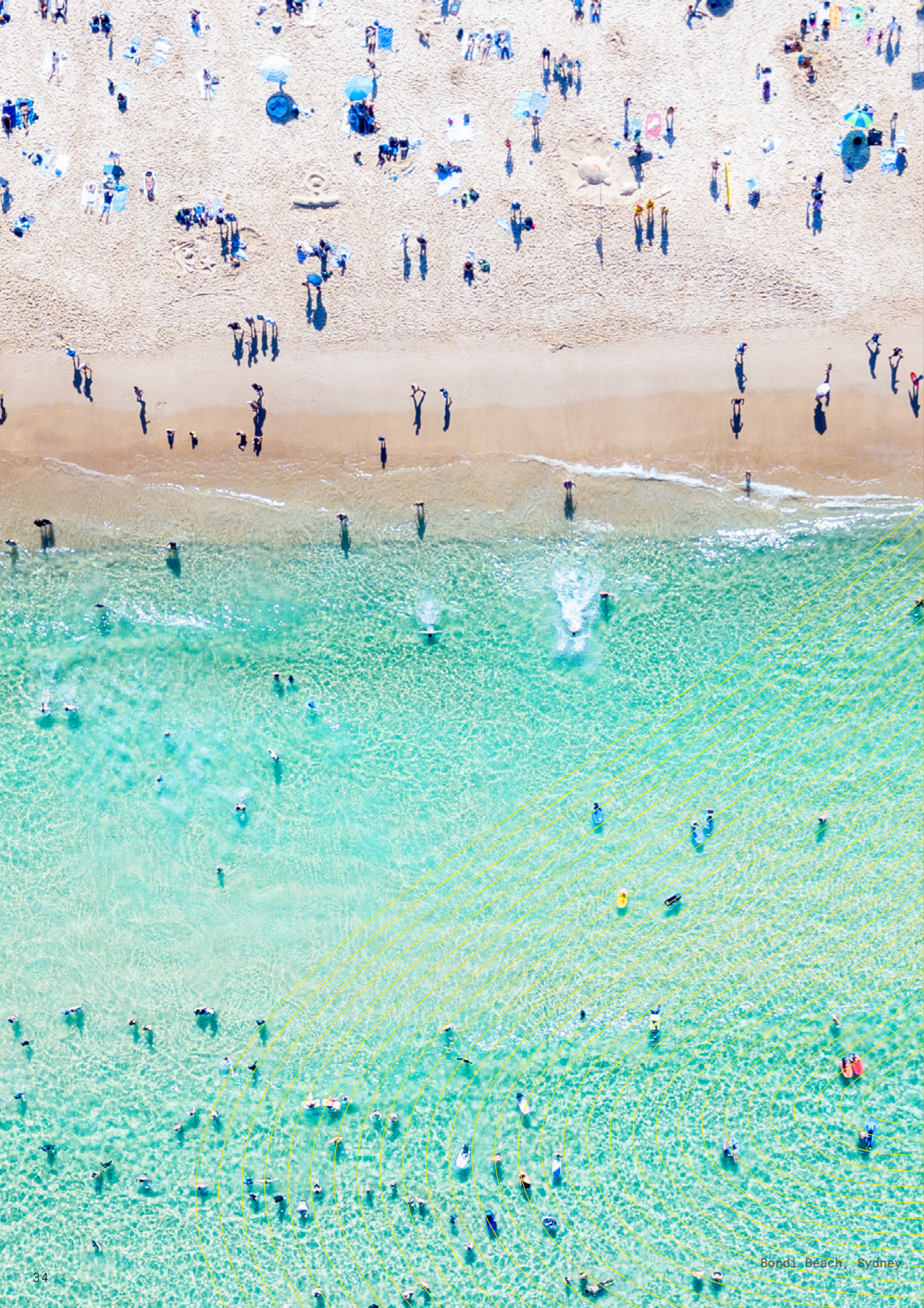
Bondi Beach, Sydney