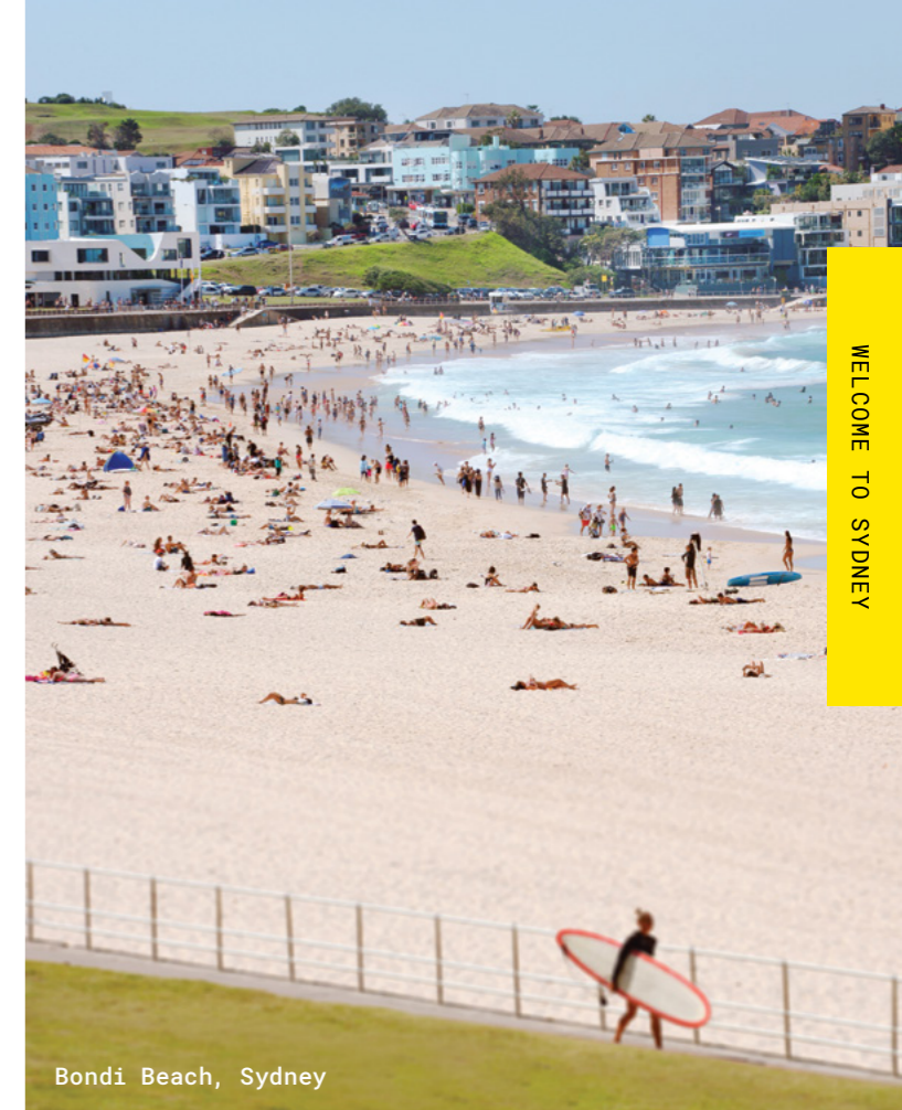
Bondi Beach, Sydney

Or if you are more into sport, we host world-class sporting events including cricket, soccer and rugby. For the more artistic visitors, there are theatre productions, concerts and festivals (many of them free!) to keep you entertained and inspired all year round. Get among it and join the fun in Sydney.