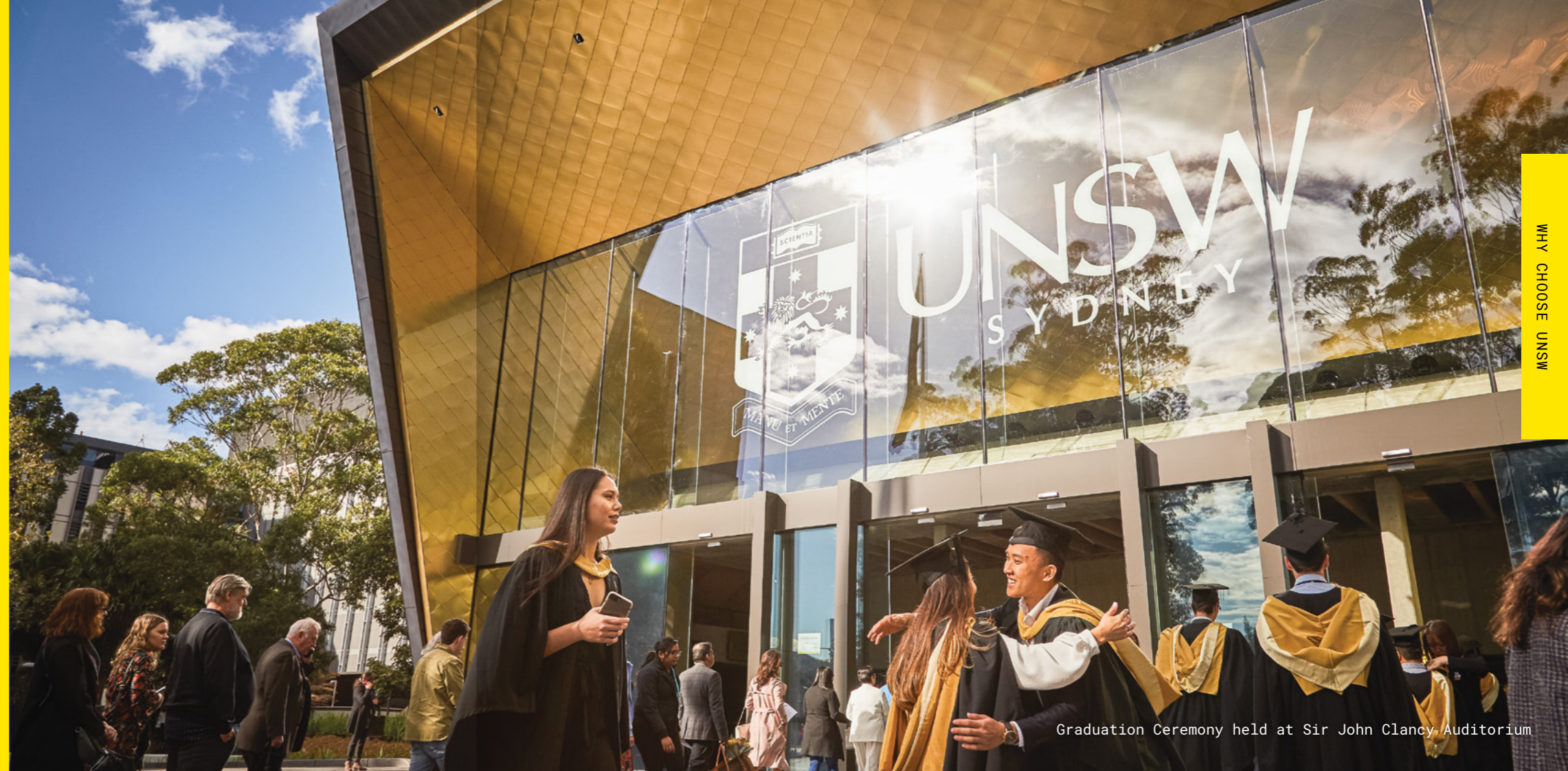
Graduation Ceremony held at Sir John Clancy Auditorium